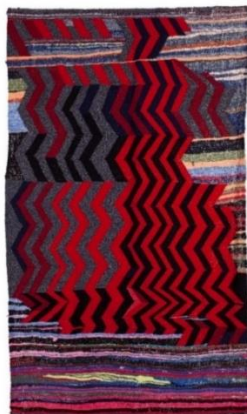
Hospital 56 , 2019. Wool, cotton and jarapa weaving © Teresa Lanceta, VEGAP, Barcelona, 2021