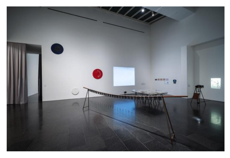
Action: A Provisional History of the 90s. Gallery view.

The years of the Spanish Transition had led to the establishment of a democracy that prioritised necessity over reason, and that favoured the future over the analysis of the recent past. This systemic erasing of memory also involved the marginalising of some of the conceptual practices already experimented in the 60s and 70s, in order to make way for more formally conventional ones that, in their celebration of appearances, gazed less critically at the complex realities of the time. However, during the mid-80s, a generation emerged throughout the country that found inspiration in the conceptual practices and Fluxus spirit of artists such as Angels Ribé, Benet Rossell, Carles Hac Mor, Jordi Benito, Carles Santos, Isidoro Valcárcel Medina, Juan Hidalgo, Esther Ferrer and Nacho Criado, prioritising processes over results and expanding artistic practice to territories that had not been previously explored.