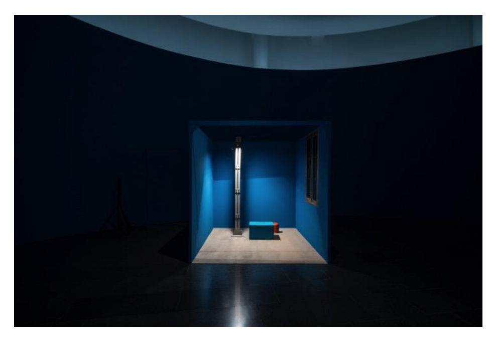
Action: A Provisional History of the 90s. Gallery view.

The exhibition is formulated as a live experience, an open process of collective creation, sharing methodologies and strategies with spectators, and it will be developed in three phases: Congress (19-20 September 2020), Laboratory (ongoing action, from 21 September 2020 to 5 February 2021) and Performance (6 February 2021).