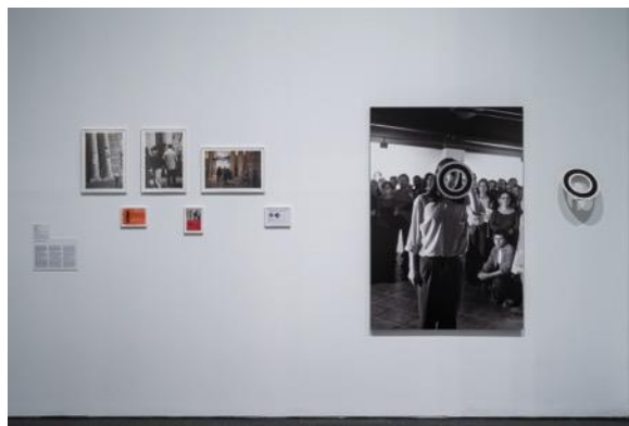
Action: A Provisional History of the 90s. Gallery view.