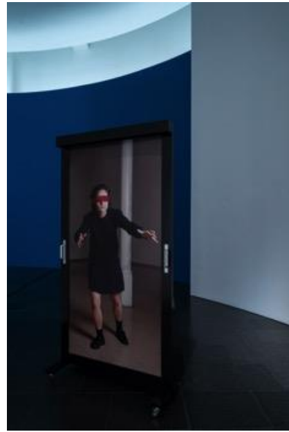
Action: A Provisional History of the 90s . Gallery view.

Circo Interior Bruto (Gross Domestic Circus) is a collective formed in 1999 in a self-managed space of Madrid's Lavapiés neighbourhood by a dozen-odd members. The project emerged as a direct response to the lack of interiority, brutality and circus spirit of the art of that time. Its activity expanded to all kinds of experimental formats and was developed in three different phases: The Creation of the World in Eleven Performances (1999-2001), Futures Market (2001-2003) and Trilogy of the Revolution (2004-2005). In 2017 it started back up again with the creation of Prometheus Bound (Teatro Pradillo) and Thus Spoke Zarathustra (Matadero Madrid). The collective is currently made up by Jesús Acevedo, Belén Cueto, Marta de Gonzalo, Rafael Lamata, Publio Pérez Prieto, Rafael Suárez, Jaime Vallauré and François Winberg. Previous members have included Paula Morón, Luis Naranjo, Eduardo Navarro, Kamen Nedev and Teresa del Pozo as well as other occasional collaborators.