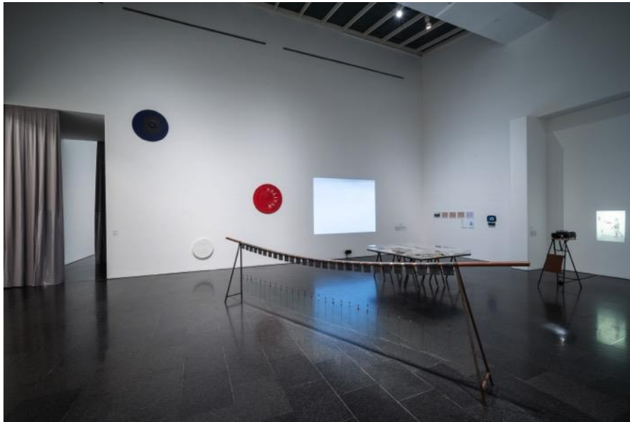
Action: A Provisional History of the 90s . Gallery view.

The years of the Spanish Transition had led to the establishment of a democracy that prioritised necessity over reason, and that favoured the future over the analysis of the recent past. This systemic erasing of memory also involved the marginalising of some of the conceptual practices already experimented in the 60s and 70s, in order to make way for more formally conventional ones that, in their celebration of appearances, gazed less critically at the complex realities of the time. However, during the mid-80s, a generation emerged throughout the country that found inspiration in the conceptual practices and Fluxus spirit of artists such as Àngels Ribé, Benet Rossell, Carles Hac Mor, Jordi Benito, Carles Santos, Isidoro Valcárcel Medina, Juan Hidalgo, Esther Ferrer and Nacho Criado , prioritising processes over results and expanding artistic practice to territories that had not been previously explored.