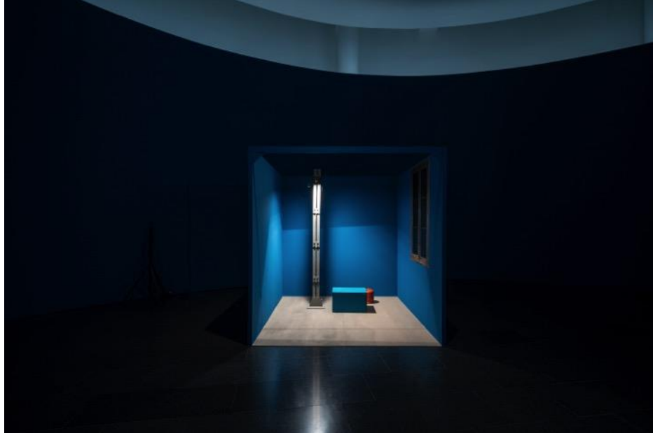
Action: A Provisional History of the 90s . Gallery view.

The exhibition is formulated as a live experience, an open process of collective creation, sharing methodologies and strategies with spectators, and it will be developed in three phases: Congress (19-20 September 2020), Laboratory (ongoing action, from 21 September 2020 to 5 February 2021) and Performance (6 February 2021).