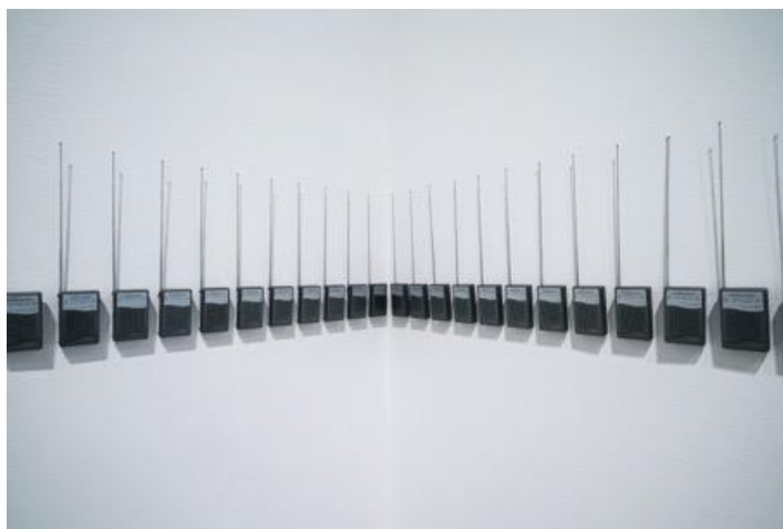
Action: A Provisional History of the 90s. Gallery view.