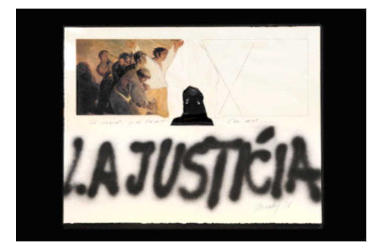
Fina Miralles La justícia (Sèrie Matances) 1977 Tècnica mixta, 51,5x66,5 Col·lecció Museu d'Art de Sabadell, ©Fina Miralles

In Collaboration with: Museu d'Art de Sabadell and Ajuntament de Sabadell