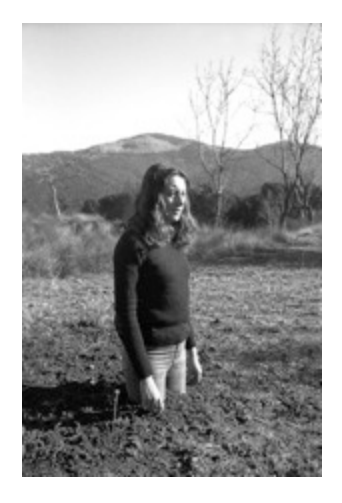
Fina Miralles Translacions. Dona-arbre [Documentació de l'acció realitzada el novembre de 1973 a Sant Llorenç de Munt, Espanya] 1973 Fotografia a les sals de plata Col·lecció MACBA. Dipòsit de la Generalitat de Catalunya. Col·lecció Nacional d'Art

although the more forcefully that power is exercised, the more it calls for subversion; the historical, political and social background that determines and conditions our lives and work; the status of women, at that time in an inferior social position, subject to male authority and restricted by specific laws largely aimed at maintaining moral codes of behaviour and the singular objective of nuclear family life; or the constant duality in her work between nature and artifice, reality and appearance, to give but a few examples.