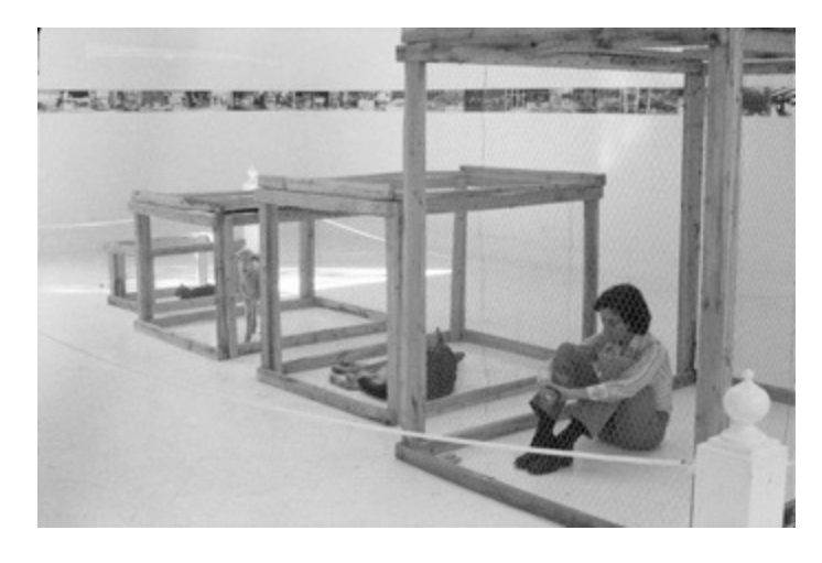
Fina Miralles Imatges del zoo , 1974 Fotografia a les sals de plata Col·lecció Museu d'Art de Sabadell ©Fina Miralles

This project seeks to readdress by journeying through a body of work of enormous importance.