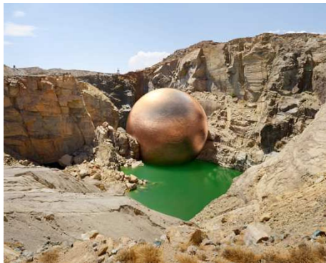
Dillon Marsh Nababeep South Mine, Nababeep, 2014 Dimensions: 50 x 62,5 cm Cortesia de l'artista i Gallery MOMO Johannesburg

This is not an ordinary love. Extraction congeals, looming large on the landscape. Like an otherworldly platonic form, perhaps a proto-machine, a copper mine in the Northern Cape of South Africa conjures a figure of thought. Organs and machines love each other, generating shock as they infiltrate one another. They fall apart and come together until it is no longer possible to discern organ from prosthesis. This exhausts and propels. A stone shatters a window. A different light enters the unease and decay of a deserted factory building. The economic tumult of the 1980s unsettled neighbourhoods across Liverpool, but it may be that the stone is yet to land. What is rejected returns in force to assert its claim.