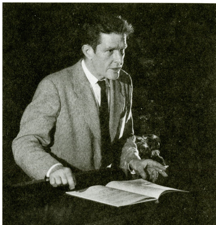
John Cage, c. 1958.

If this word, music, is sacred... we can substitute a more meaningful term: organization of sound.